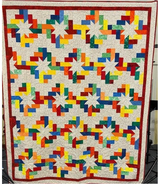
"JESTER" 73" x 91"

Since QuiltFest is before our September meeting, we only have two more General Meetings before the drawing at the close of QuiltFest. Get you tickets, and then get them turned back in! Linda McClelland