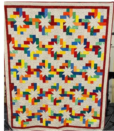
"JESTER" 73" x 91"