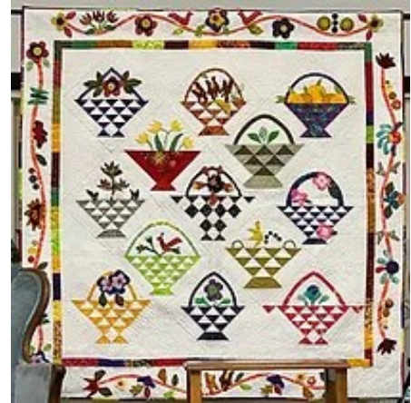
Our 2023 Raffle Quilt! "Baskets of Whimsy"

Providing a safe and comfortable place for children who have been removed from their homes and are waiting foster care.