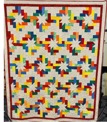
"JESTER" 73" x 91"

The deadline for the final payment of the registration fee ($300 total) is the October 17 guild meeting. You can make your payments at the guild meetings in September and October, or your payment can be mailed to Pat D'Elia (her address is in the member handbook).