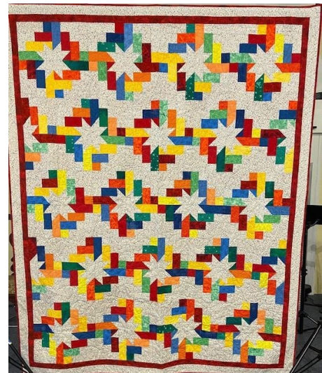
"JESTER" 73" x 91"