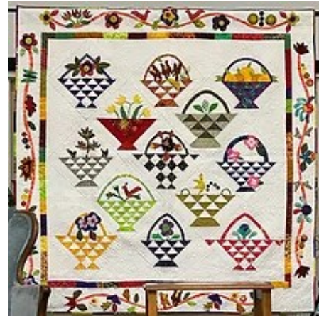
Our 2023 Raffle Quilt! "Baskets of Whimsy"