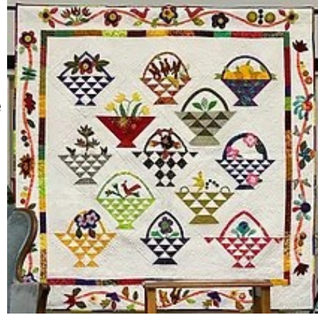
Our 2023 Raffle Quilt! "Baskets of Whimsy"