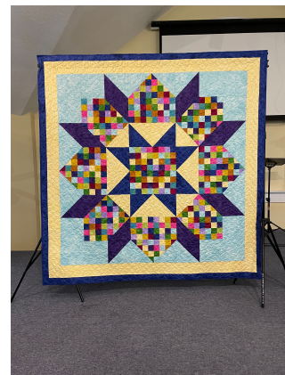
Swooning Stars 74" x 74"