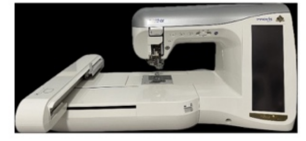
Table Top Handi-Quilter

Great condition. Includes 2 cases, 4 hoops and manual. Asking $1,200. Nena Bird. Text 904-923-3311.